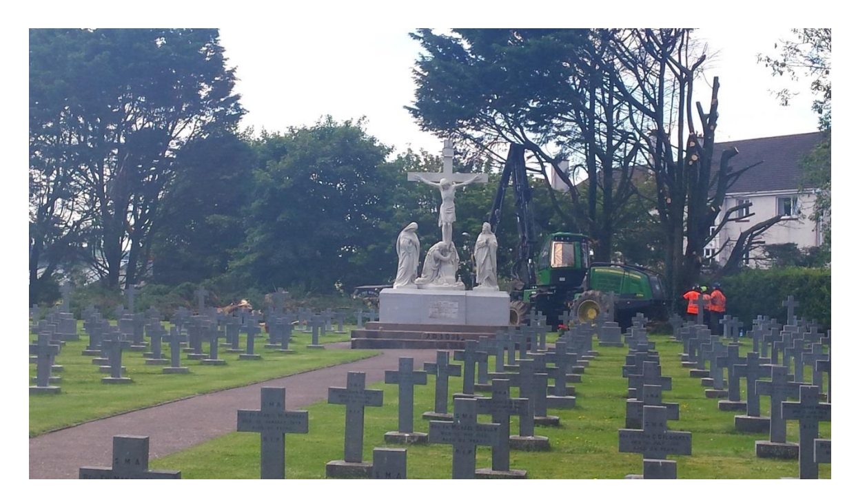
Removing trees at the African Missions, Wilton, Cork