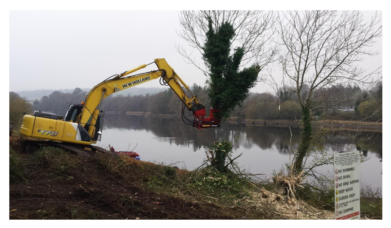
360 Excavator with tree shears attached at work