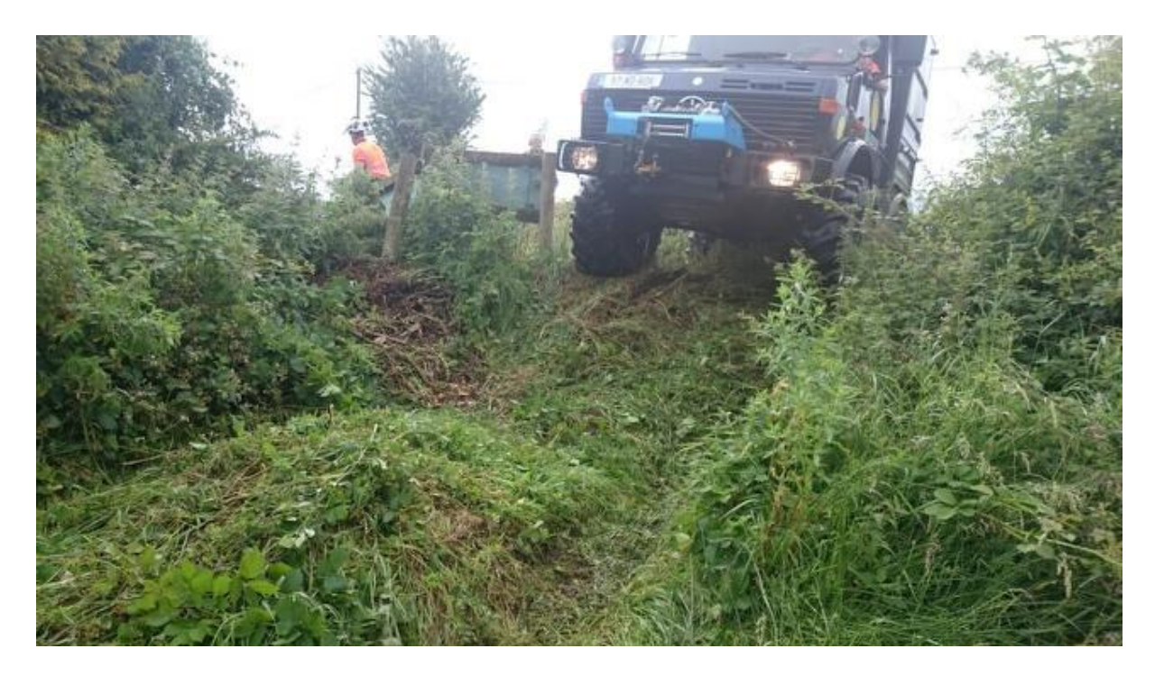
Unimog at work on very rough terrain