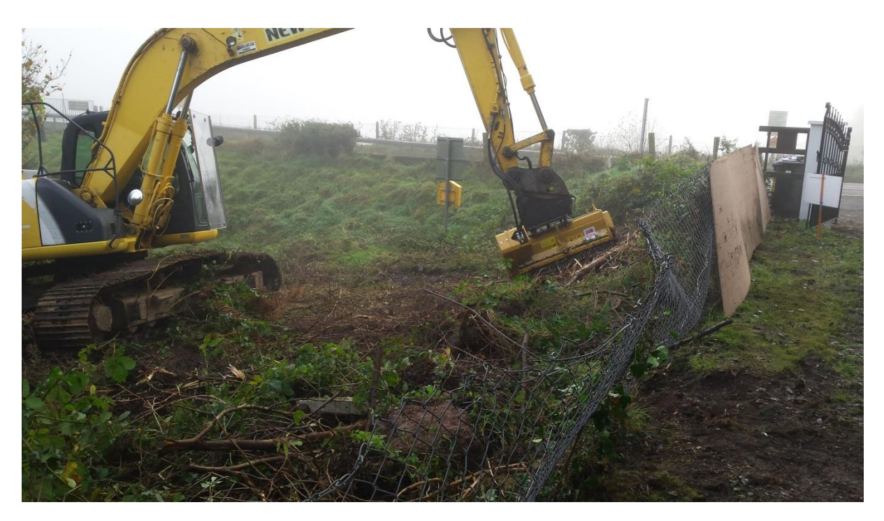
360 Excavator with Mulcher at work