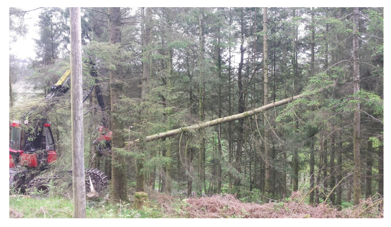
Harvester at work in the forestry